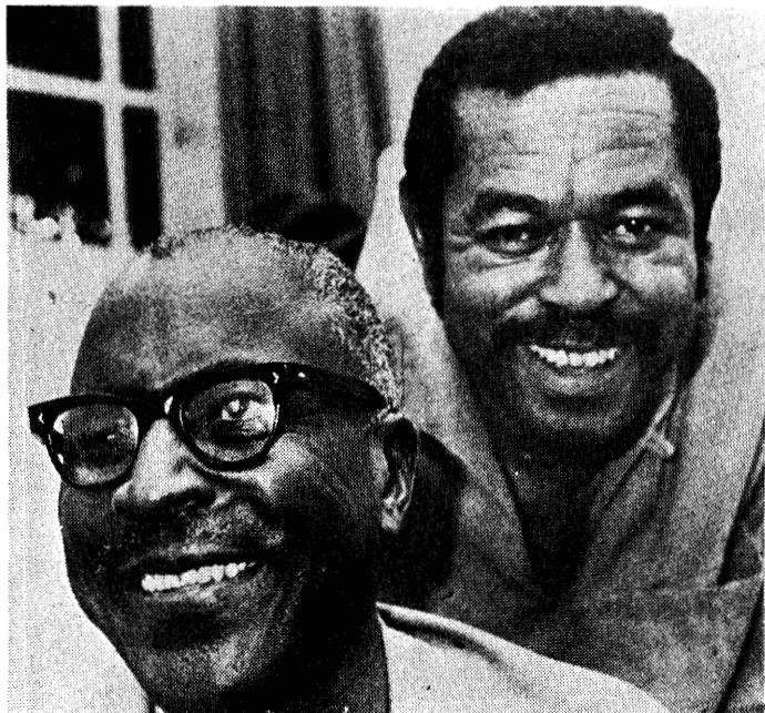
SONNY TERRY & BROWNIE MCGHEE

"the greatest living exponents of black folk blues."